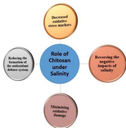
Figure 1: The main role of chitosan in plants under salinity conditions.

Treating seeds before cultivation with chitosan reduces the incidence of viral diseases. For example, treating bean seeds