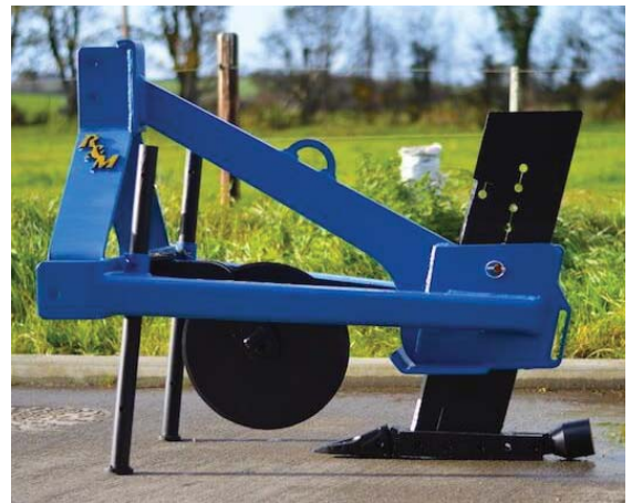
Figure 2: Mole drain plow [17].