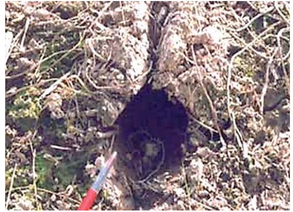
Figure 1: Example of a mole drain [6].

Mole drain channels can also be opened with a 5 cm - 7.5 cm diameter torpedo attached subsoiler behind the feet (Figure 3). Thanks to the torpedo, cylindrical drain channels are formed in the soil. If the application with the subsoiler is applied perpendicular to the main drainage lines, in addition to evacuating excess water, additional water discharge is provided thanks to the effect of the subsoiler [1,4,8-10]. A subsoiler prepared for the mole drainage method is connected to the tractor from a three-point linkage system and used at a working depth of approximately 70 cm. The tip of the subsoiler is located in the front of the torpedo; it has a pointed-rounded or forward-curved-flat working tip. The ones with a round base have a base diameter of 40 mm - 100 mm. The power demand of the machine is around 45 kW [8].