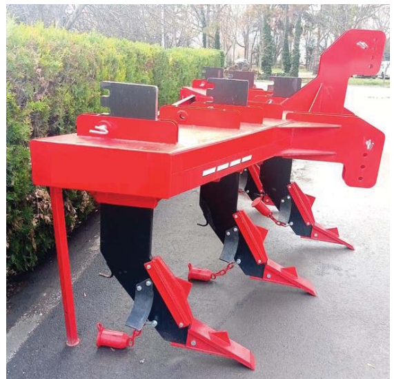
Figure 3: A subsoiler that can open a mole drain.

In mole drainage, during the opening of the channel, the soils are pushed to the sides where the mole plow and expander pass. As the foot advances, it creates crevices and cracks that increase the porosity and hydraulic conductivity of the soil (Figure 4). The angle of these crevices and cracks is about 45°