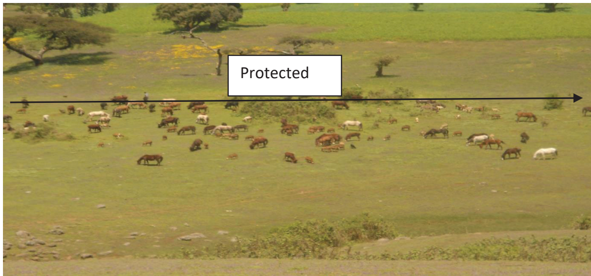
Figure 1: Paddock grazing.

grazed. In this system of grazing ('Kuta'system), priority of feeding is given according to the age, and species of the animal. Accordingly small ruminants and calves are allowed to graze first, followed by matured cattle and then equines are allowed to graze finally in mixed with other live stocks.