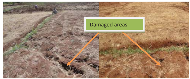
Figure 2: Damage to soil bunds in some of the farm plots in the watershed.

different perception on the factors affecting the effectiveness of the structures and have a detailed knowledge of, and opinion about, what works best where. A complete rejection of level soil bund and high complaint on fanya juu by farmers due to improper design was reported Koga catchment of Ethiopia [28]. Farmers invest for structures when the problem exists and they are confident for its effectiveness in controlling soil erosion [29–32]. The households' response in relation between bunds specification and soil erosion shown as about 91% of the respondents with physical structures in their farmlands suggested that there is direct relation between bund spacing and soil erosion that soil erosion increase as spacing between the bunds increases (Table 6). About 79.5% of the respondents also indicated as soil erosion decreases as the embankment height increases and about 18.2% responded as soil erosion happened in their farmlands irrespective of embankment height. Regarding embankment width majority of the respondents (about 65.5%) said that it has no effect on the level of soil erosion. However, about 27.3% of the respondents said that soil erosion decrease as embankment width increases.