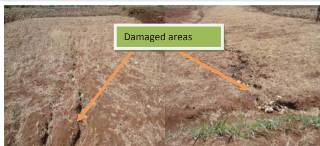
Figure 1: Soil erosion in some of the farm plots the watershed.

The change in perception of farmers in soil and water conservation practices in their farmlands directly related with the effectiveness of the structures [9,26,27]. Farmers have