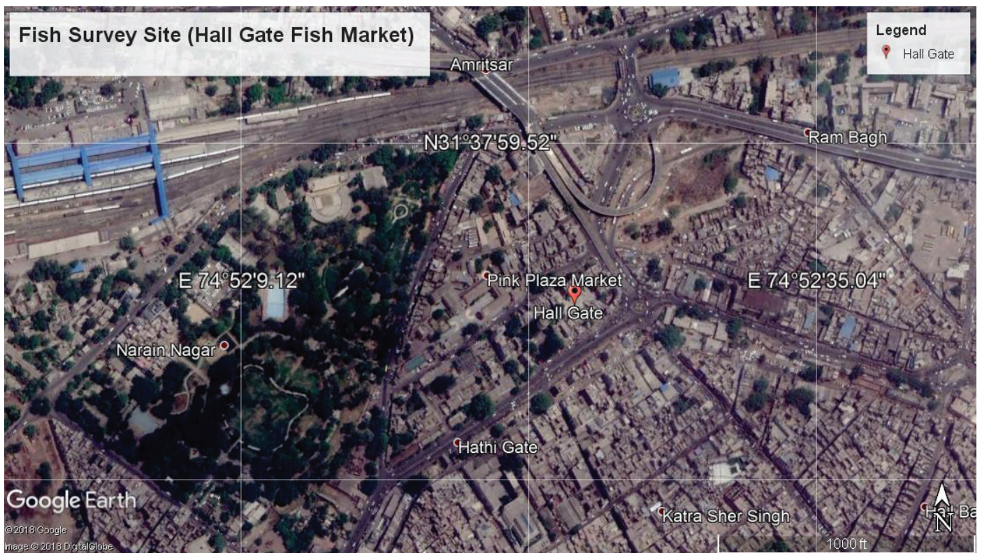
Figure 3: Site of the fish survey at Amritsar Fish Market, Punjab, India, prepared by Google 3D Earth Software.