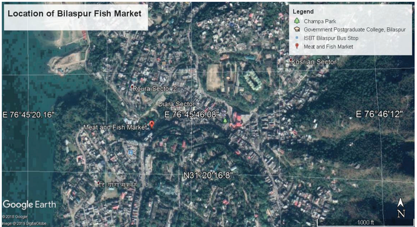
Figure 2: Site of the fish survey at Bilaspur Fish Market, Himachal Pradesh, India, prepared by Google 3D Earth Software.