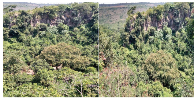
a) Valleys and associated landscape