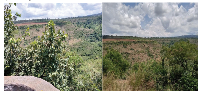
e) Geographical features and landscape pattern in the garden