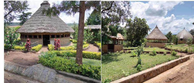
c) Cultural houses in the garden