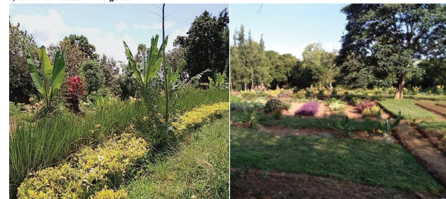
d) Forest and garden within the site