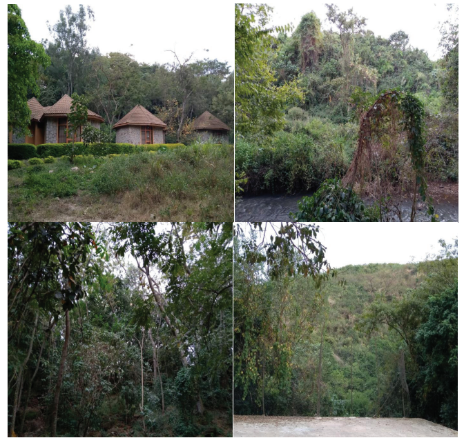
Figure 3: Saron lodge and its surrounding in Dilla Town.

Good perception of community towards conservation and existence of ecotourism support policies promote ecotourism and facilitate its implementation. Similarly, existence of academic institution helps to address shortage of skilled manpower in ecotourism sector and promotes the implementation of ecotourism in scientific and effective ways in the area. The expansion of academic institutions have a positive impact on ecotourism development because it helps to produce skilled manpower, such as supply of tourism consultant professionals, develops the capacity of workers by providing training facilities and promote ecotourism by solving