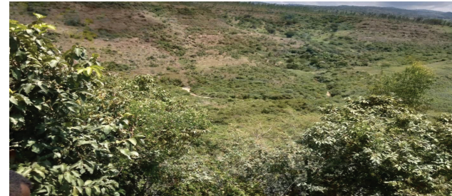
b) A river in front of the garden