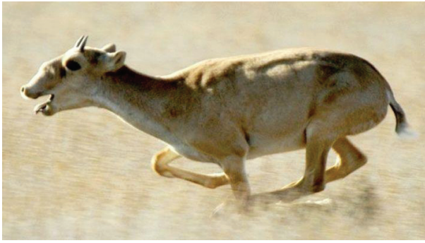
Figure 3: Saiga - a unique type of hoofed animals, the age-mate of a mammoth and rhinoceros.

Saigas often change pastures and, as a rule, only partially pit vegetation. Their diet consists of different plants, which are reluctantly or completely not eaten by the livestock ( anabasis , bug-infested , Kermek , ephedra , etc.).