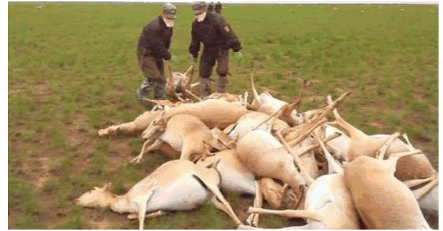
Figure 4: The mass death of saiga in the south Kostanay region.

Large-scale epizooty of pasteurellosis (May 2015) caused an ambiguous reaction and a rough public response. There were many hypotheses which interpret the version of the reasons for emergence of a mass case of saigas' murrain. The majority of the versions have the right for existence until the true reason of this catastrophic natural phenomenon is not established.