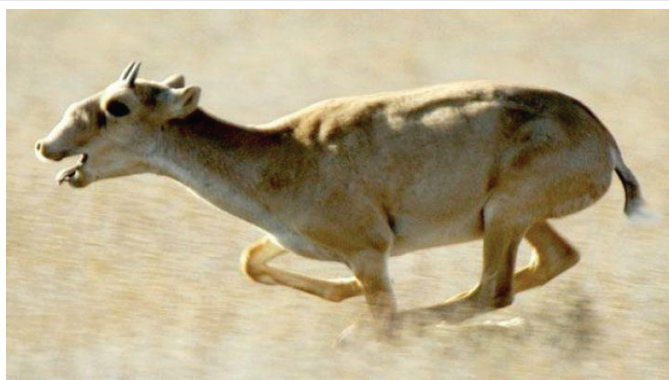
Figure 3: Saiga - a unique type of hoofed animals, the age-mate of a mammoth and rhinoceros (photo Nurushev M.Zh.), [9,25].

Generally it is juicy grass: Salsola, Ephedra distachya, various species of worm wood ( Artemisia ), wheat grass comb ( Agropyron pectinatum ), Mortuk ( Eremopyrum triticeum ), Kentucky bluegrass ( Poa pratensis ), fescue ( Festuca valesiaca ), Kermek ( Limonium vulgar ), boy Aly ch ( Salsola arbuscula ), Kokpek ( Atriplex cana ), Anabasis salsa ( Anabasis salsa ), kochia ( Kochia scoparia ), sorrel ( Rúmex ), which accounted for 98% of the stomach contents. Careful analysis showed that most of them are not only nutritious but contain medicinal properties [25].